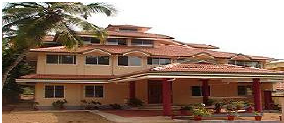
Ladies hostel, NIT Calicut (Kerala)

As per section 38 (1) of the Statute, every Institute shall be a residential institution and all the students and research scholars should be provided accommodation in the hostels and halls of residence built by the Institute for the purpose.